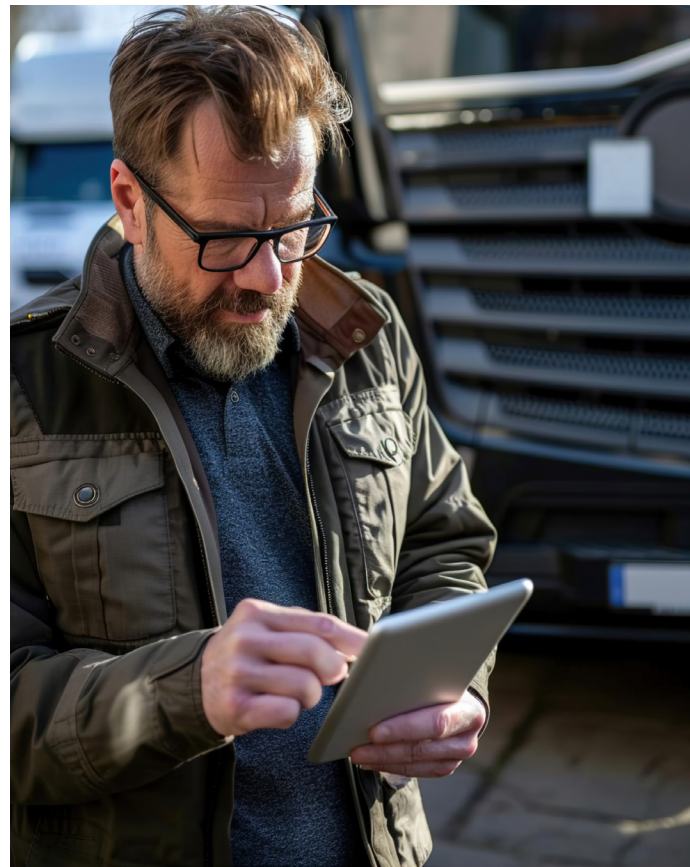
Driver Induction: 5-min safety check—digital or at the gate—before drivers enter.

No more back-and-forth trips to the transport office. Updates and instructions reach drivers directly, digitally, and in real time through C3 Hive .